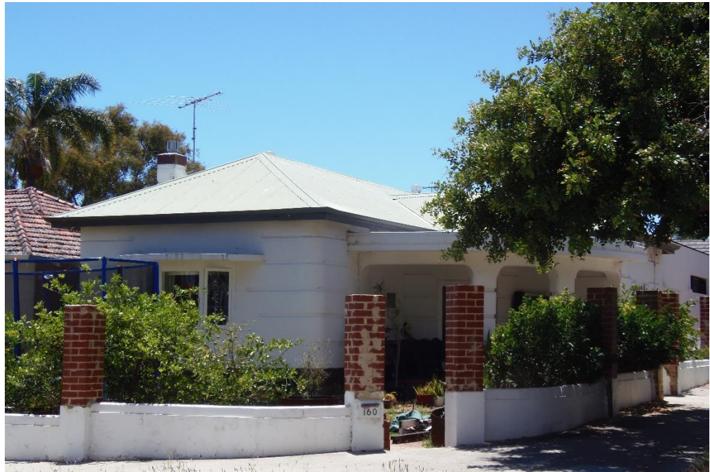
Additional Photograph (162 Heytesbury Road, December 2021)